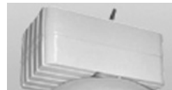
HID ballast housing